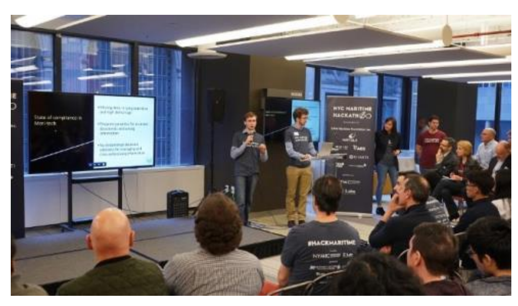
New York Maritime Innovation Center Hackathon