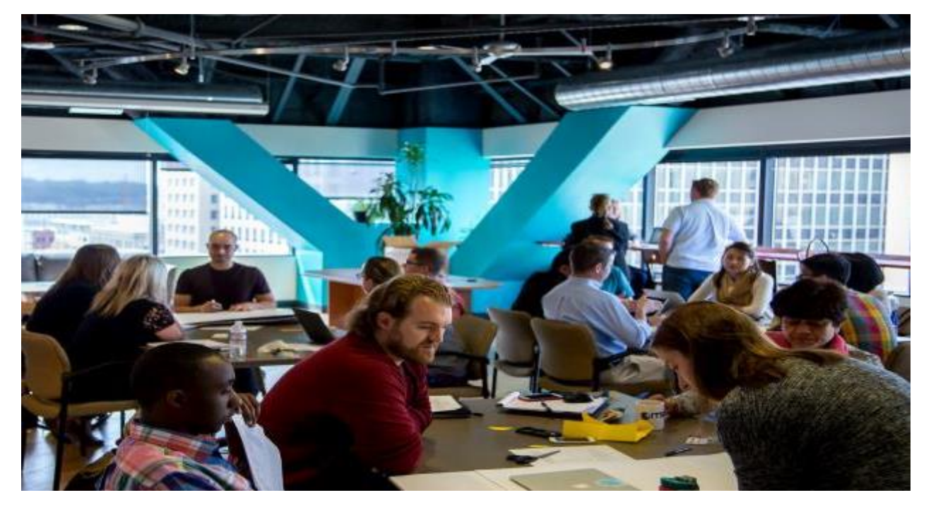
SURF Incubator in Seattle helps early stage high-tech companies